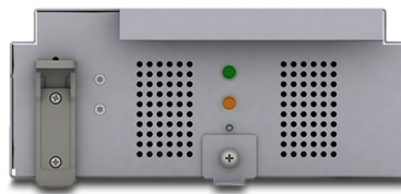
Liebert® APS Battery Module APSBATMODCU includes 2 battery modules, or 1 complete battery string. each complete string uses 2 bays in the Liebert APS.