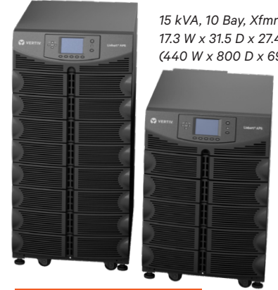
15 kVA, 10 Bay, Xfmr-free 17.3 W x 31.5 D x 27.4 H inches (440 W x 800 D x 695 H mm)