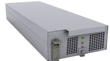
Liebert® APS Charger Module 10A battery charger that operates in parallel with the chargers integrated in each Power module. To increase runtime in the Liebert APS, this 10A charger should be used when battery string to power module ratio is greater than 3:1.