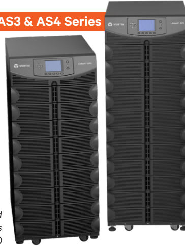
15 kVA, 12 Bay, Xfmr-based 17.3 W x 31.5 D x 41.7 H inches (440 W x 800 D x 1060 H mm)